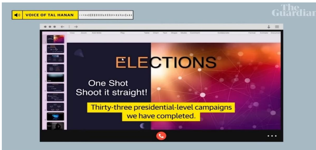
Figure 3: Screenshot from The Guardian’s Exposé on Team Jorge